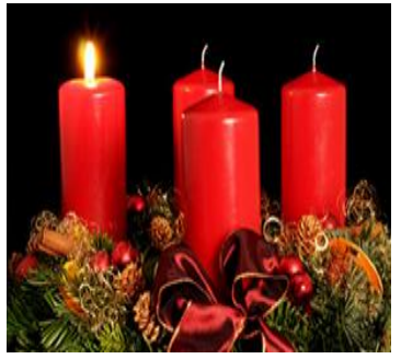
Advent from the Latin Adventus, meaning 'arrival'